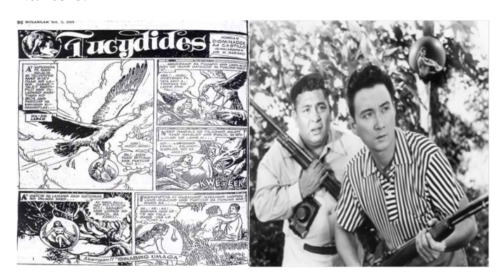
Figure 12: Dual face of the rural setting in Tucydides.

It is for this reason that in both the komiks and the film version, the rural landscape served three functions: as background to actions, as ally, and as antagonist. The forest has been Tucydides' sanctuary until she reaches adulthood, to protect her secret from the villagers. On occasions when she needs to shrink her size in order to fit inside her twin bladder, Tucydides is exposed to the danger posed by pythons, eagles and other wild animals that roam in the forest. Sometimes, she faces the danger of being caught by bird hunters.