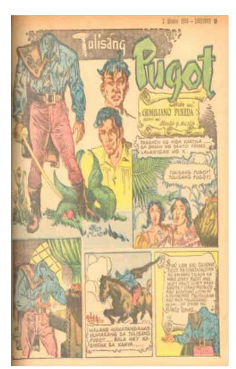
Figure 4 : Splash page of Tulisang Pugot showing opening panels.

In Tucydides , normal life in a barrio called Lagamba maintains a quiet existence, which is interrupted by the birth of a girl with a twin bladder in the household of Feliz. It was a birth that has implications in the heavily-superstitious neighborhood. While the visitation of the supernatural is a public occurrence in Tulisang Pugot , the birth of a supernatural girl is kept in secrecy by her parents. Tucydides' parents are aware of the disastrous impact of such an occurrence on the normative sense of communal life prevailing in 1950s rural Philippines.