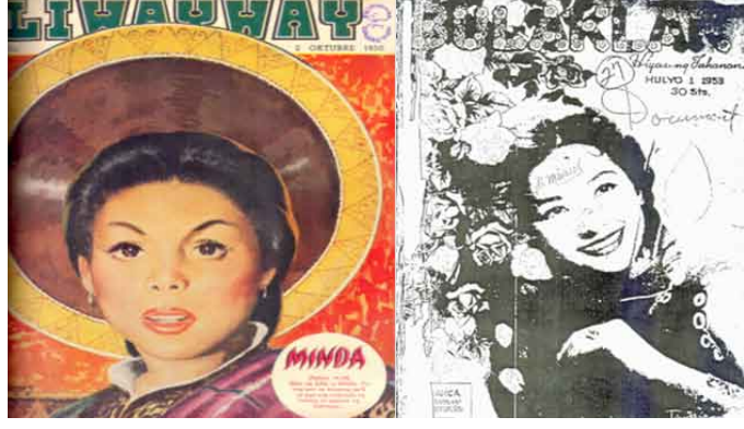
Figure 2: Magazines where the extant komiks series were serialized.