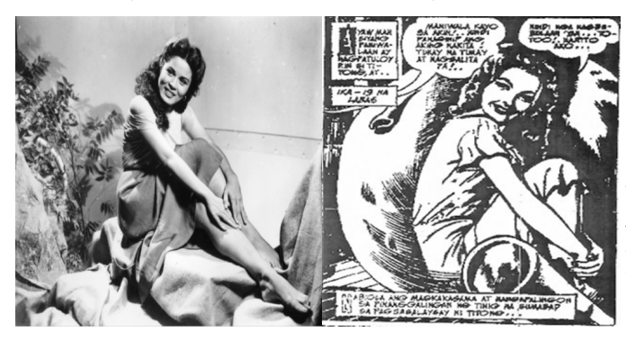
Figure 8: "Monstrous" feminine in Filipino komiks-to-film fantasy. Tucydides lives in her twin-bladder.

The heroine's unique gifts become a sort of compensation for what she lacks or for the normality that she craves for. The writers of fantasy, Soledad Reyes (1986) opines, "try to rectify nature's neglect and contemporary society's lack of concern by endowing the crippled, the ugly, the sickly and the poverty-stricken with marvellous gifts" (p.175).