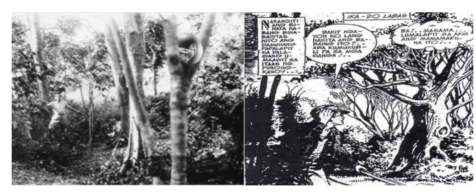
Figure 7: The mise-enscene in Tucydides reveals a sort of pastoral gothic that may be unique to the nation's folkloric life.

In Tucydides , the gothic may be located in the main character herself. Filipino fantasy is replete with unusual characters, freaks, grotesques, and the almost monstrous. Tucydides represents an underside of country life that has been dominated by superstition and folk belief. It smacks of a pastoral sort of gothic.