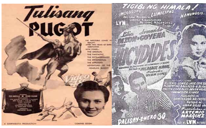
Figure 3: Promotional posters for Tulisang Pugot and Tucydides.