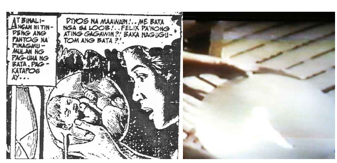
Figure 5: The visual artist as spinner of fantasy. Tucydides features the birth of a freak of nature in a pastoral setting.

between the supernatural and the realistic drama. It shows a cosmopolitan pueblo in 19th century Philippines. A picture of a colony on the verge of change is shown in contrast to the fabulous tales spun around the headless bandit. In Tucydides , the birth of a freak of nature is a counterpoint to the pastoral simplicity of Lagamba.