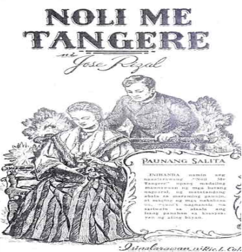
Figure 1 :Komiks treatment of Noli MeTangere written by Clodualdo del Mundo in the 1950s.

Inglis (1990) contends that "the best kind of media theory to begin with is a historical one" (p.4). There seems to be a truism to Inglis' opinion. Any attempt to adapt prior material in the various film eras may be assumed as part of a continuum that began in the 1950s. This is the story of komiks -to-film adaptations that catered to the fantastic and the folkloric in the 1950s.