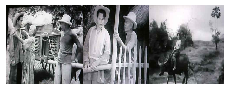
Figure 17: Colonial images as negotiated images of the local.

With the film adaptation of Tulisang Pugot and Tucydides, komiks have become transitional texts. The sequential, classic and realistic brushstrokes of the images that lend an iconography for Filipino fantasyscape become more real or life-like in the film. The films recreate an idiom for visual fantasy by drawing inspiration from literary and folkloric sources to create what is Filipino, homely and local.