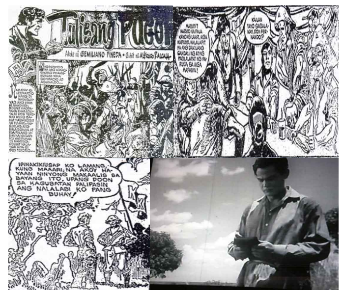
Figure 16: The revolution as subtext in the komiks story but absent in the more sanitized film version.

The komiks story actually made an effort to situate the actions during the period of general anxiety and anticipation—the months prior to the breakout of the revolution. The following is the mast head of the 44th chapter of the komiks series that evidently associates the main character, Tulume/Tulisang Pugot/Don Fernando, with the revolutionary movement and a panel from the 14th chapter depicting the Kalayaan newspaper headlining the headless bandit as the new enemy of the people: