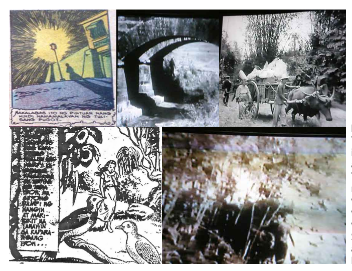
Figure 10: Clockwise. Tulisang Pugot is able to interweave colonial city and folk scenes while Tucydides projects the rural landscape as site where man communes with nature.

Tulisang Pugot is therefore a specimen of how the popular writer and filmmaker make use of the materials at their disposal. At the turn of the 20th century, the romance novels were favourite reading materials of Filipinos. The works of Dumas, Sir Walter Scott and their contemporaries were read by the komiks novelists and filmmakers alike. "Foreign films with fantasy characters have spawned a number of Filipino counterparts," adds the CCP Encyclopedia (Tiongson, 1994, p. 88). The interest in these types of materials persists to this day, prompting Soledad Reyes's (1986) observation that the romance mode is a dominant tendency in recent literary and popular history.