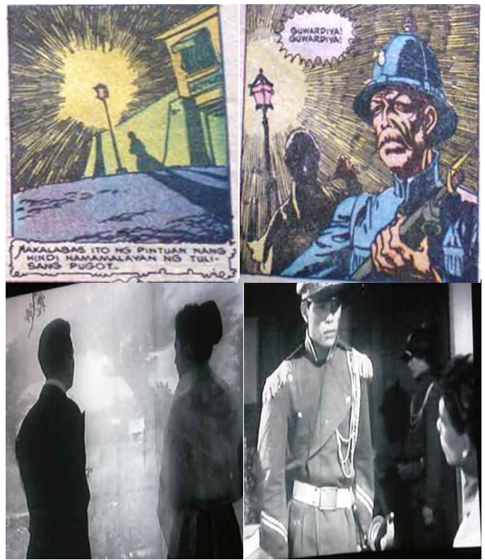
Figure 15: 19<sup>th</sup> Century Philippine popular iconography in Tulisang Pugot .

system of paying tax tributes. They live in the margins of social existence, constantly leading precarious lives. This has been immortalized in the character of Kabesang Tales.