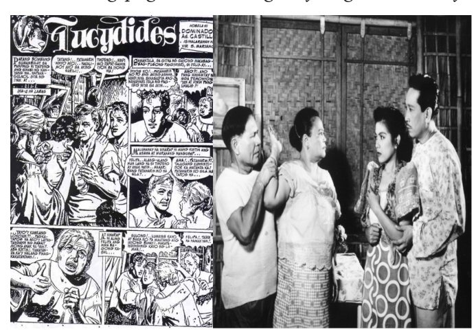
Figure 11: Superstition as folkloric/common sense knowledge.

The interplay of folk superstitions and folk religiosity emerges to the fore as the couple realizes that the mother's forgiveness is not yet forthcoming. Tindeng encourages her husband to seek God's help: "Hindi tayo dapat mawalan ng pag-asa. Humingi tayo ng awa sa Diyos." [We should not