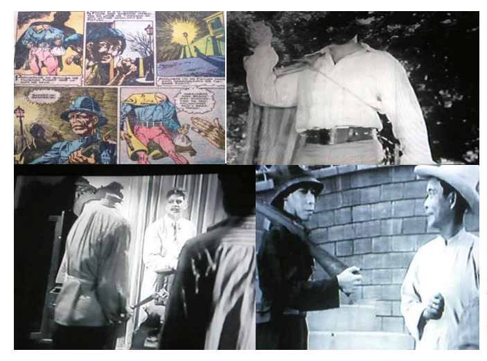
Figure 9: Filipino adventure genre invoked in Tulisang Pugot , with obvious borrowings from foreign sources.

By enlisting the presence of a ghastly headless bandit in the midst of a cosmopolite pueblo and a busy walled city where the imperial gaze sees all indio-related activities as suspect, the story smacks of deliberate anachronism. Tulisang Pugot does not aim at achieving historical realism but rather at recreating the adventure genre. The Filipino adventure genre has been popular not only during the 1950s but throughout all periods of the narrative tradition. This is a primeval Filipino predisposition. For the pre-colonial native, the real merges with the fantastical. This is a quality of the Filipino which is predisposed to the uncanny, which means "seemingly supernatural in origin or character" ("Edges of Reality," 1999, p. i). Being