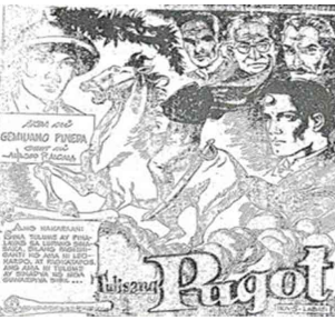
Figure 6: The headless bandit motif as borrowed character and as located in gothic tradition of colonial literature.

In Tucydides , the gothic may be located in the main character herself. Filipino fantasy is replete with unusual characters, freaks, grotesques, and the almost monstrous. Tucydides represents an underside of country life that has been dominated by superstition and folk belief. It smacks of a pastoral sort of gothic.