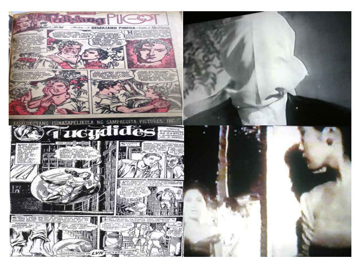
Figure 14: Metamorphosis of the hero/heroine as turning point in fantasy.

The komiks original has been able to localize the fantastical elements in Tucydides by utilizing details such as actual places from the primary world to serve as disruption, transgression or aspects of otherness. Insofar as the story is localized, the characters drawn from the folk, and the lore paints familiar color of the mythical Filipino. The komiks story then creates an alternate—albeit imaginative—world. Soledad Reyes (1986) cannot be more apt: