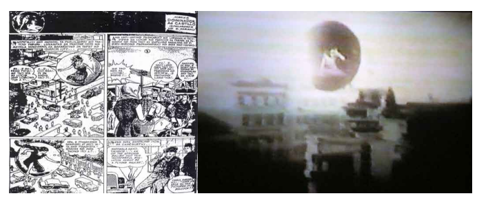
Figure 13: The city as antagonist in Tucydides .

obviously plays a large part in fantastic literature for this reason" (p. 81). In the cases of Tulume, the tulisan, and Tucydides, metamorphoses turned imperfections into occasions for redemption.