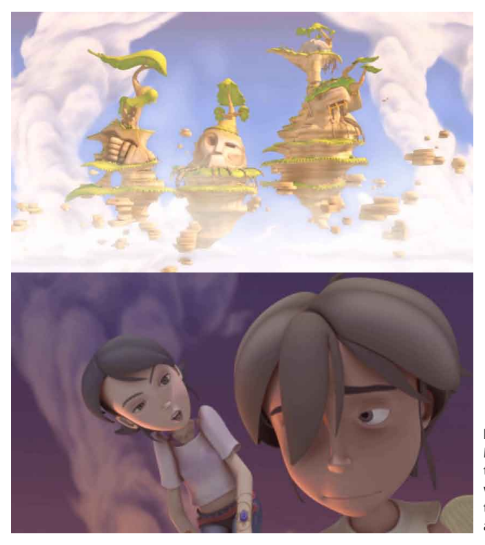
Figure 2. In Metanoia, May encourages Nico to experience the "real" world more. Screenshot time codes 00:41:10 (top) and 00:46:13 (bottom).

Umalis ka kaya sa harap ng computer? Sumama ka sa amin maglaro bukas. Problema kasi, lahat ng experience mo, nandito lang sa game na 'to. Bigyan mo naman yung totoong Nico nang kaunti. Gusto mo bang ganyan ka na lang lagi, takot sa mundo?