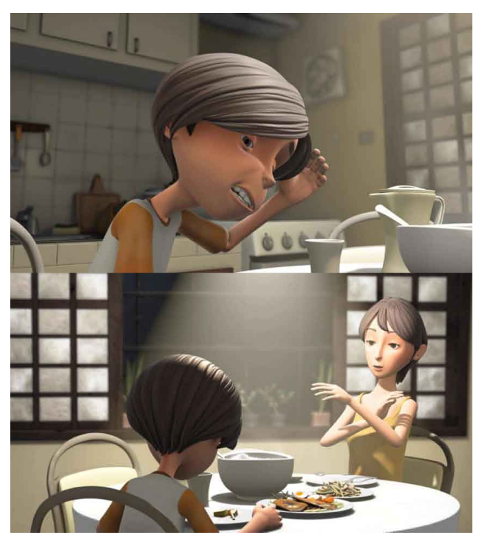
Figure 3. Simulating 3-point lighting and following the 180degree rule in the mother and son dinner scene. Screenshot time codes: 00:17:58 (top) and 00:18:02 (bottom).

teamwork, coupled with his developing notion of heroism, save the day by winning not just the wager but delivering the world from the machinations of a powerful enemy. This resolves the dramatic arc of this coming-ofage film. In terms of the character arc, Nico comes out a better person, with more insight into how the world works; thus, the classical Hollywood narrative ends, with all the spectatorial pleasures with which it comes.