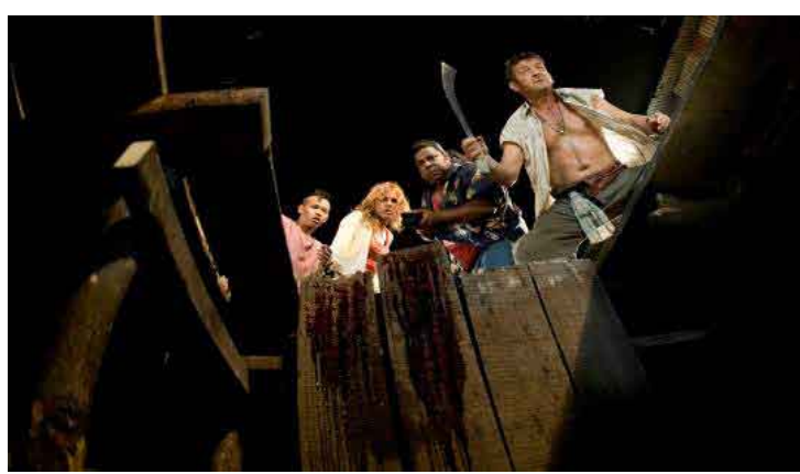
Figure 3. Fright and faith systems: Amphibious uses a cross-cultural cast to highlight differing belief patterns.

Shane's daughter transform into a distorted and hairless native boy when she re-emerged from the makeshift coffin that was the centrepiece of the dance troupe, the film thus emphasized the transgressive and transcultural interchange between Western and Indonesian bodies. In so doing, the sequence also fulfilled another of Heider's (1991) key criterion for the Indonesian film text: a recourse to exaggerated bodily contortion and facial distortion used to show a range of wild and unnatural emotions. While these physiognomic displays may be linked to the overblown traditions of Indonesian popular theater, they also intersected globally defined gestures of unease (what Heider terms "the anger face"), with culturally-specific signs of aggression: "That is to say there is a facial expression which is recognizable as "anger" but in which the eyebrows are raised high—not lowered as they should be in the pan-cultural anger expression" (p. 65).