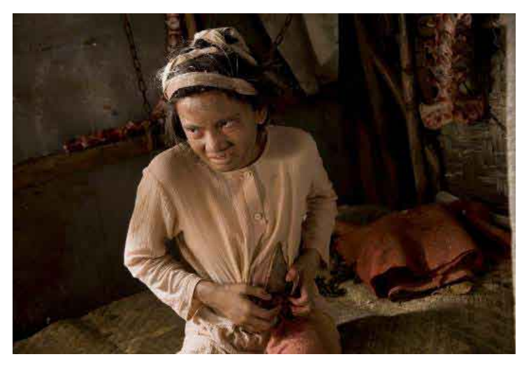
Figure 6. Accepting the 'female' curse: Tamal's birthing scene in Amphibious.

woman's disruptive potential by conjoining phallic and reproductive traits. In the case of the ill-fated heroine of Siddique's case study, "She reveals her awesome reproductive powers not by creating a baby, but in replicating her arms into dismembered rotting phallic weapons with which she kills men" (p. 31).