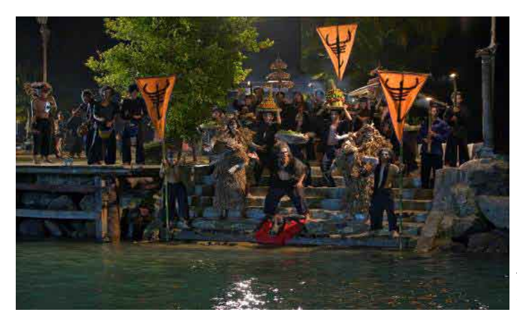
Figure 2. Ritual routines: the "Indonesian" segment of Amphibious...

Shane's daughter transform into a distorted and hairless native boy when she re-emerged from the makeshift coffin that was the centrepiece of the dance troupe, the film thus emphasized the transgressive and transcultural interchange between Western and Indonesian bodies. In so doing, the sequence also fulfilled another of Heider's (1991) key criterion for the Indonesian film text: a recourse to exaggerated bodily contortion and facial distortion used to show a range of wild and unnatural emotions. While these physiognomic displays may be linked to the overblown traditions of Indonesian popular theater, they also intersected globally defined gestures of unease (what Heider terms "the anger face"), with culturally-specific signs of aggression: "That is to say there is a facial expression which is recognizable as "anger" but in which the eyebrows are raised high—not lowered as they should be in the pan-cultural anger expression" (p. 65).