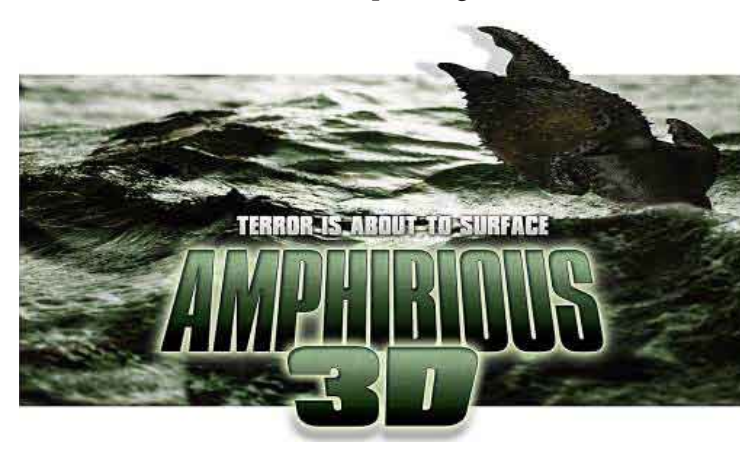
Figure 1. International allusion: marketing "Indonesian" myths under the title Amphibious 3D.

With a multi-layered narrative that promotes both Western and Indonesian characters while attempting to unite the distinct mythologies from these competing cultures, Amphibious at first appears as an overambitious project that fails to fully embody the "nationalistic" elements that its Eastern setting implied. This disjuncture seems to be confirmed by the differences between the international and domestic marketing produced to promote the film. For instance, its international release trailer (under the title Amphibious 3D ), emphasized its connection to established American underwater monster movie traditions such as Jaws (1975), by referencing the plight of a skinny-dipping teenage girl being attacked by an unknown and underwater presence, in a manner similar to the infamous opening attack of a female bather in Spielberg's film.