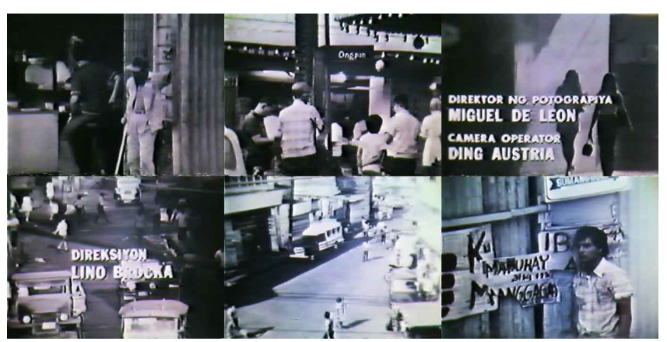
Figure 1. Opening sequence of Manila in the Claws of Light . Screenshots from Manila in the Claws of Light (Brocka, 1975).

A Kracauerean cinematic realism of everyday life can be observed in the opening sequence of Manila in the Claws of Light . The sound of horse hooves and a visually poetic string of black-and-white images of the streets, "city symphony" style, open the film with a portrait of Manila waking up to a new day: shop owners setting up their stores, street vendors preparing their goods, bums still sleeping on the street, etc. The revving of engines,