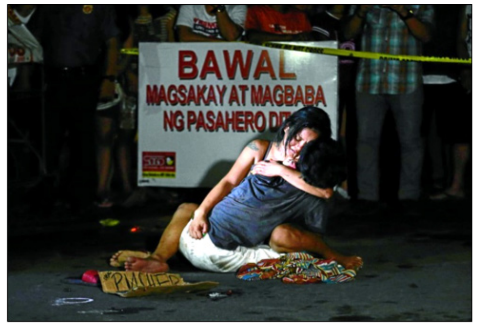
Figure 1: "Lamentation." Philippine Daily Inquirer , 04 July 2016. Retrieved from http:// newsinfo.inquirer.net/798551/church-thou-shall-not-kill. Copyright 2016 by Philippine Daily Inquirer .

PDI's online publication were isolated. It has to be noted that results coming from Google's search engine are arranged in a hierarchy of importance and relevance based on a trade secret algorithm that is in turn based on a trade secret set of factors. But experts in the field of search engine optimization have identified click-through, bounce, and dwelling time rates as some of the leading factors that affect this hierarchy, and they are more directly shaped by users, instead of website creators and designers (Southern 2016). Since the selection process of Lerma's photographs was already delimited to those coming from PDI's online publication that is supposedly manned by more or less the same website and webpage creators and designers, this paper can deemphasize the factors that are more directly shaped by these technical people. Thus, the 25 photographs selected could be assumed to have had more exposure to more Internet users than the rest, at least during the period the image search was done. This paper, therefore, considered the following 25 images, labelled with their respective titles, sources, and dates of publication, as the most representative documents taken by Lerma on the ongoing drug war: