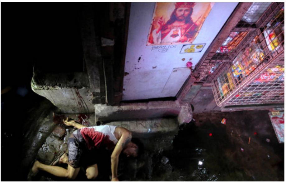
Figure 7. "Policeman Killed," Frame, Philippine Daily Inquirer , 21 July 2016. Retrieved from http://newsinfo.inquirer.net/802212/6-killed-by-cops-in-bulacan-drug-buy-busts. Copyright 2016 by Philippine Daily Inquirer .