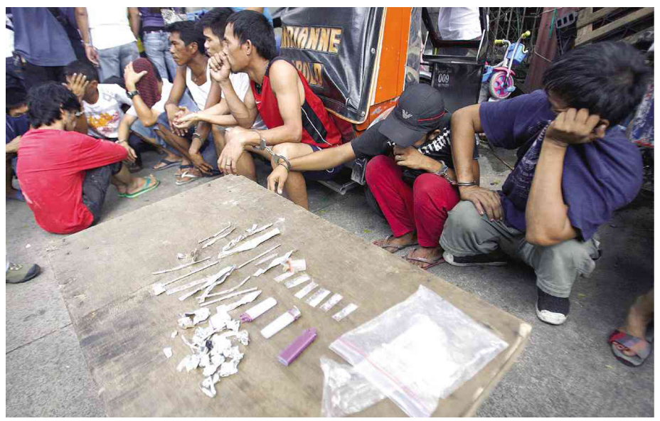
Figure 21. "Drug Den Raid in Quezon City," News Information/Metro Manila, Philippine Daily Inquirer , 24 October 2016.