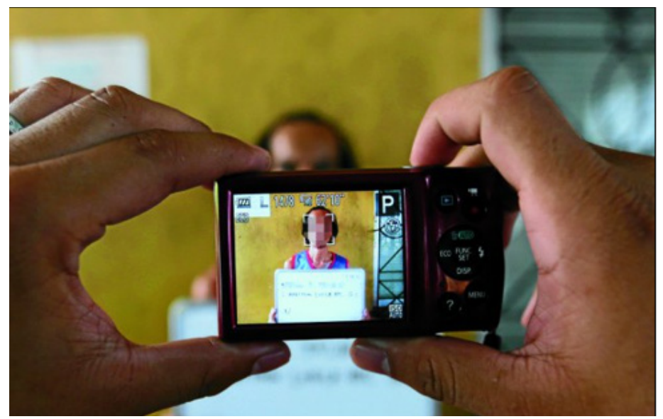
Figure 4. "A Drug Dependent's Mug Shot is Taken," Philippine Daily Inquirer , 14 July 2016. Retrieved from http://newsinfo.inquirer.net/797445/300-qc-barangay-officers-test-positive-for-drugs. Copyright 2016 by Philippine Daily Inquirer .