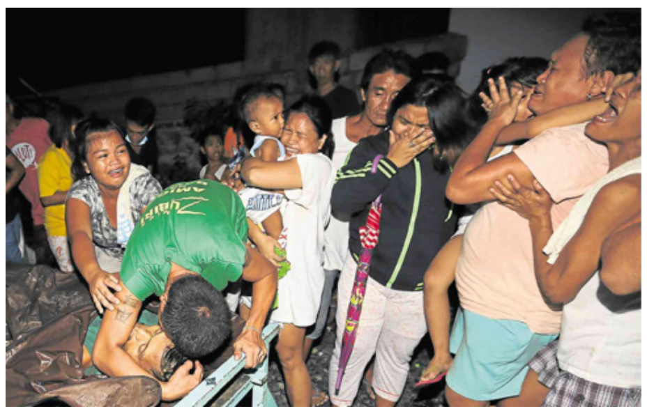
Figure 11. "Family in Anguish," News Information/Metro Manila, Philippine Daily Inquirer, 19 August 2016. Retrieved from http://newsinfo.inquirer.net/807669/killings-go-on-as-senate-probes-digong-drug-war.