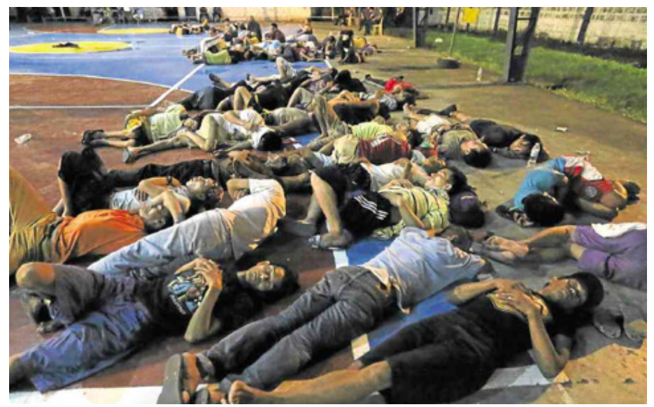
Figure 16. "Drug Suspects Arrested in Two Raids," News Information/Headlines, Philippine Daily Inquirer , 18 September 2016. retrieved from http://newsinfo.inquirer.net/816264/145-suspects-nabbed-in-culiat-raids. Copyright 2016 by Philippine Daily Inquirer .