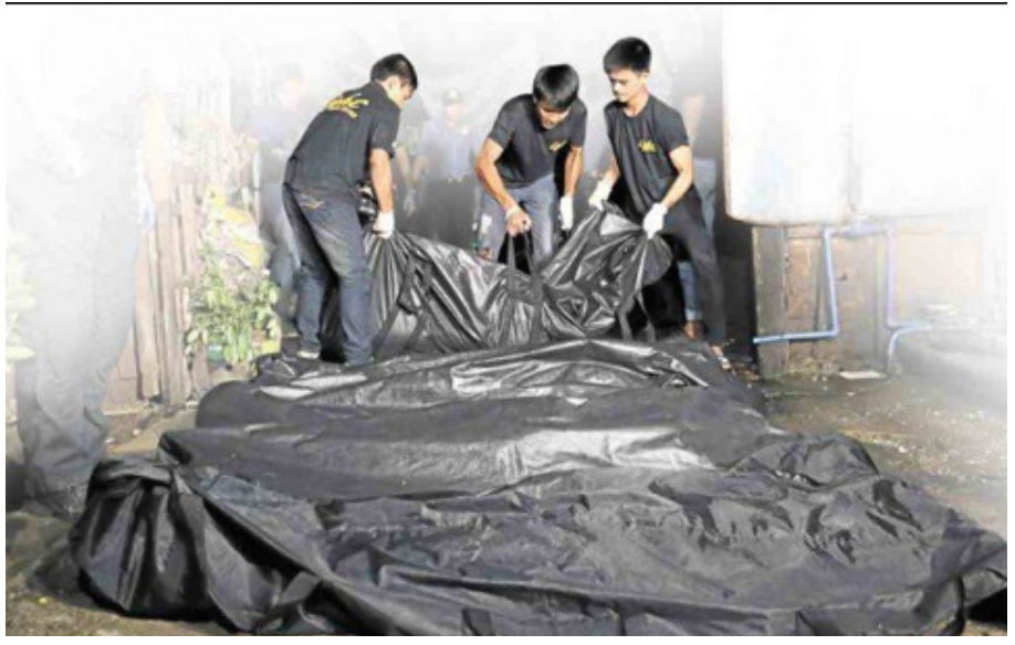
Figure 15. "Latest Four to Fall," Headlines, Philippine Daily Inquirer , 10 September 2016.