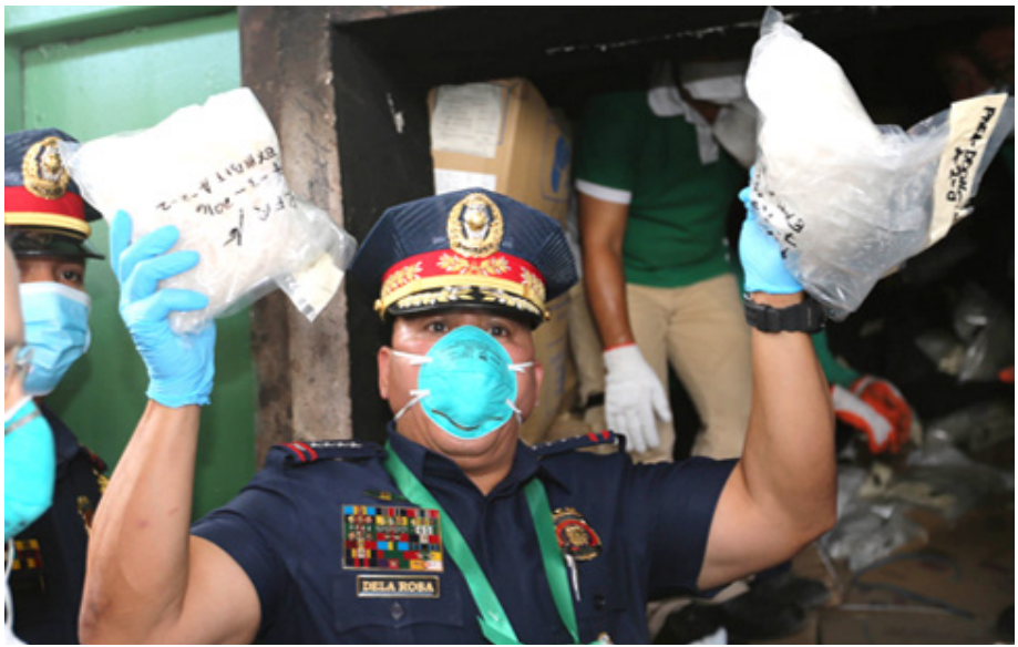
Figure 5. "Bato Destroys 'Bato," Philippine Daily Inquirer, 14 July 2016.