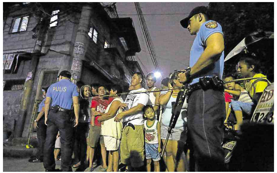
Figure 24. "Policemen Keep a Curious Crowd.. from a Crime Scene," News Information/ Headlines, Philippine Daily Inquirer, 21 November 2016. Retrieved from http://newsinfo. inquirer.net/846158/drug-war-may-affect-kids-for-the-worse