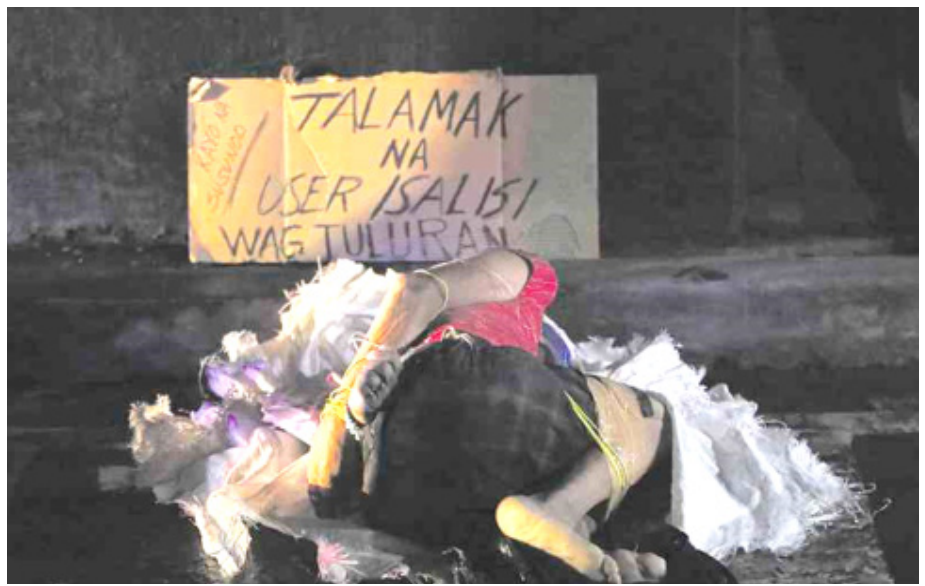
Figure 6. "Pray You Don't See this on Your Street," News Information/Headlines, Philippine Daily Inquirer , 20 July 2016.