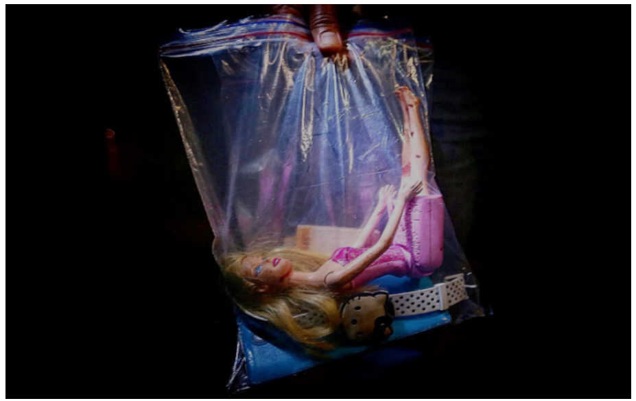
Figure 30. Plastic Doll Stained with Blood, a Wristwatch and a Wallet that Belonged to a Slain 17 Year Old Girl.

Image 29. "A Coroner Cuts through the Packaging Tape that Concealed the Face of a Victim of Summary Execution."