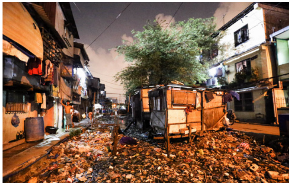
Figure 9. "Dark Side of Drug War," Frame, Philippine Daily Inquirer , 30 July 2016. Retrieved from http://newsinfo.inquirer.net/801509/widow-tells-duterte-kill-drugs-not-people. Copyright 2016 by Philippine Daily Inquirer .