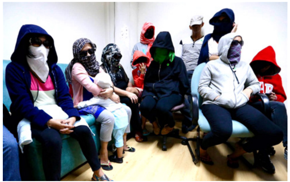
Figure 13. "Waiting to Testify," Frame, Philippine Daily Inquirer , 23 August 2016.