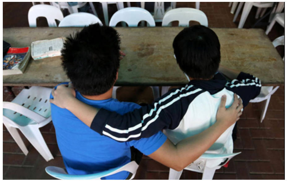
Figure 18. "After a Small Fight. . . these Men are Made to Stick Together," Special Feature, Philippine Daily Inquirer , 08 October 2016. Retrieved from http://www.inquirer.net/duterte/ drug-rehab-3. Copyright 2016 by Philippine Daily Inquirer . same URL?