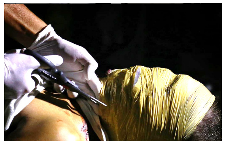
Image 29. "A Coroner Cuts through the Packaging Tape that Concealed the Face of a Victim of Summary Execution."