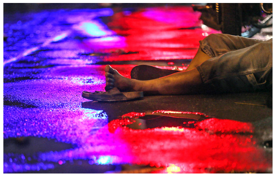
Figure 25. "Another Killed," Frame, Philippine Daily Inquirer , 22 November 2016.