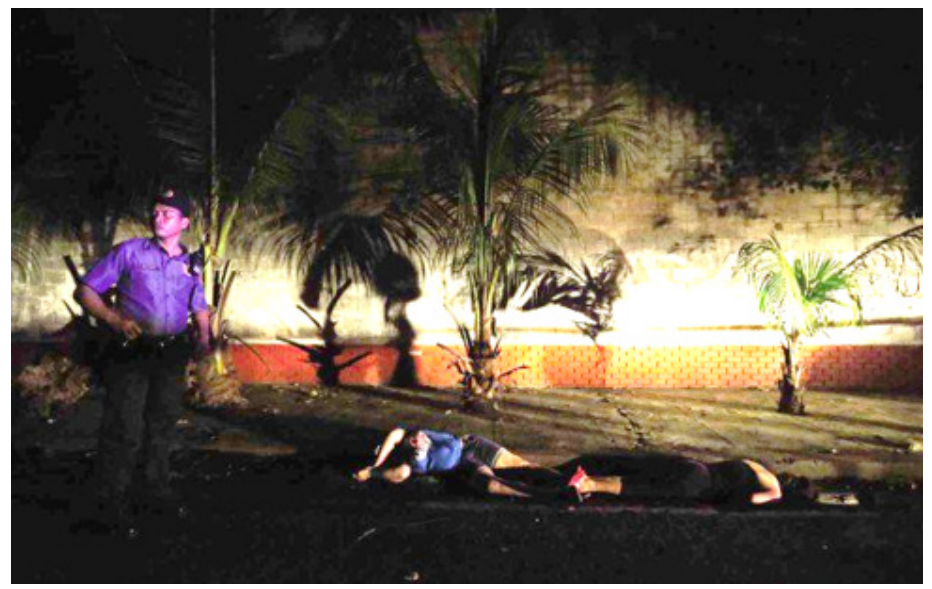
Figure 8. "Salvage Victims," News Information/ Headlines, Philippine Daily Inquirer , 22 July 2016. Retrieved from http://newsinfo.inquirer.net/798060/5-more-drug-war-deaths-in-12-hrs. Copyright 2016 by Philippine Daily Inquirer .