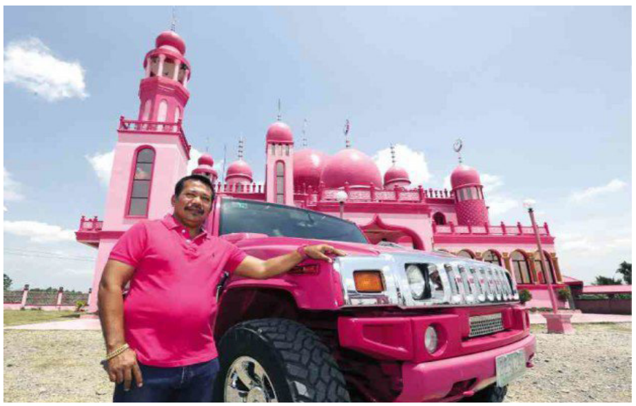
Figure 23. "Color of Love," Motioncars, Philippine Daily Inquirer , 03 November 2016. Retrieved from http://newsinfo.inquirer.net/835698/end-of-the-road-for-mayor-on-drug-list-9-others Copyright 2016 by Philippine Daily Inquirer .