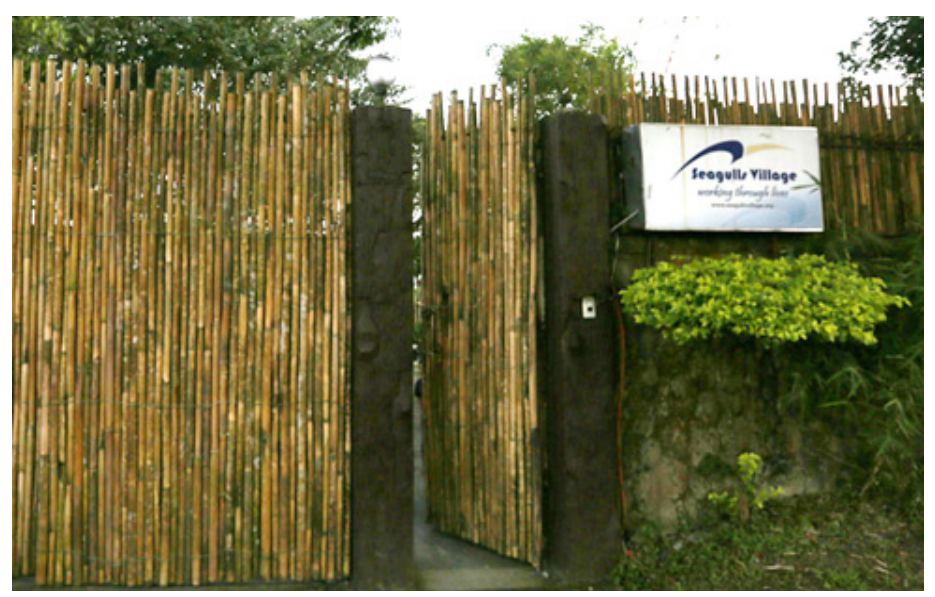
Figure 20. "Seagulls in Tagaytay City Caters mostly to Patients who can Afford to Pay," Special Feature, Philippine Daily Inquirer , 08 October 2016. Retrieved from http://www.inquirer.net/duterte/drug-rehab-3. Copyright 2016 by Philippine Daily Inquirer . same URL?