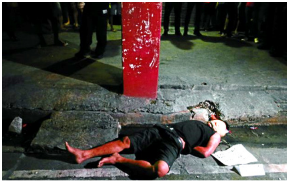
Figure 10. "The Body of an Alleged Drug Pusher and Robber," News Information/Featured Gallery, Philippine Daily Inquirer, 06 August 2016. Retrieved from http://newsinfo.inquirer. net/803494/deads-kin-offered-psychiatric-help.