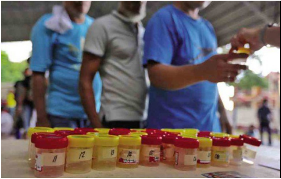
Figure 3. "Confessed Users Undergo a Drug Test in Camp Karingal." Philippine Daily Inquirer , 07 July 2016. Retrieved from http://newsinfo.inquirer.net/797445/300-qc-barangay-officers-test-positive-for-drugs. Copyright 2016 by Philippine Daily Inquirer .