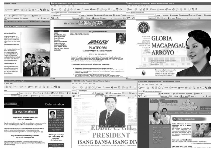
Figure 1. Official campaign websites of the 2004 Philippine presidential candidates (Retrieved on April 6, 2004).

materials, as well as the streaming of campaign video clips. Moreover, Villanueva's site is one of the few, if not the only one, that tapped into the power and potential of SMS technology (e.g., "Support the presidential bid of Bro. Eddie Villanueva by texting BRO. EDDIE to 46333"). Similarly, the two political party websites of Bangon Pilipinas, Villanueva's party, contain more online features than the websites of the other political parties.