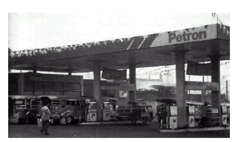
Figure 1. There is a semblance of order and cleanliness at a Petron gas station. The photograph, which is contained in an essay that favors oil deregulation, delivers a "business-as-usual" message, devoid of any complaints from customers and passers-by. (Energy Forum, April 1995, p. 3)

A semiotic interpretation of selected images reflects how the cultures of acclimatization and resistance are promoted implicitly or explicitly. Figure 1 shows a community where the gas station of Petron, one of the three biggest industry players, is located celebrating its fiesta (town celebration). The latter is manifested by the presence of banderitas (small inverted triangles in various colors attached to a long string) on the right side of the station's logo. This implies that the oil company is part of the community and that it is accepted by the residents there due to the presence of banderitas. The station is clean and this sends a message that