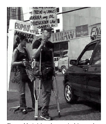
Figure 11. Addressing motorists passing through Welcome Rotonda in Manila, an unidentified protester sums up an alternative analysis of the downstream oil industry through the placard he holds during a nationwide transport strike on November 24, 2004.

depicting the personal inconvenience brought about not only by the man's differently-abled state but by the deregulated regime. The reader is then left to analyze which is more burdensome for the man, his physical state or the deregulated regime.