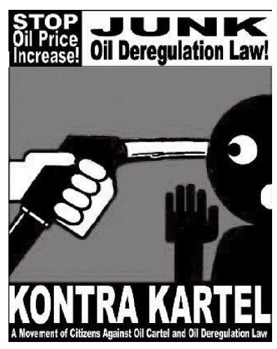
Figure 10.Established in 1995, Kontra Kartel is a broad alliance of groups and individuals opposed to the existence of an oil cartel and the deregulated regime in the downstream oil industry. Its logo shows the ordinary consumers being "held up" by oil companies.