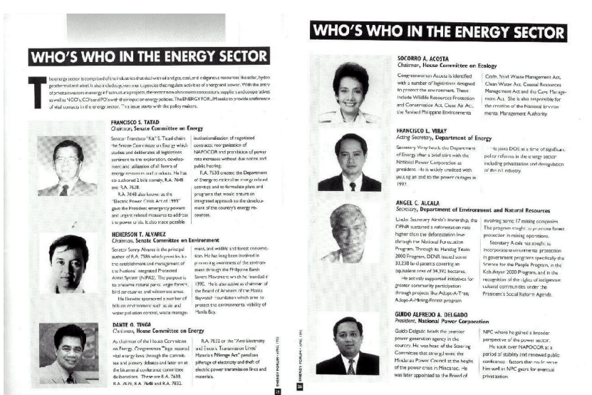
Figure 5. The first issue (April 1995) of the Energy Forum presented "who's who in the energy sector" (25-26) and the editors deemed it important that policy makers be among those featured first. The seven government officials on these pages are Francisco S. Tatad (Chairman, Senate Committee on Energy), Heherson T. Alvarez (Chairman, Senate Committee on Environment), Dante O. Tinga (Chairman, House Committee on Energy), Socorro A. Acosta (Chairman, House Committee on Ecology), Francisco L. Viray (Acting Secretary, Department of Energy), Angel C. Alcala (Secretary, Department of Environment and Natural Resources), and Guido Alfredo A. Delgado (President, National Power Corporation). They all exude an aura of authority by being well-groomed and this is important in projecting that they are among the learned few who can competently assess the situation of the downstream oil industry which is part of the energy sector.

blood) at the tip of the arrow. This simple illustration drives home the message that oil deregulation is bleeding the people dry.