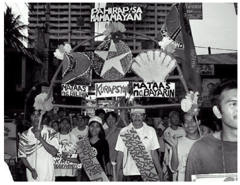
Figure 2. Workers, urban poor and farmers gather for their alternative take on the Santacruzan. Part of the Philippines' traditional Flores de Mayo, the procession was staged on April 23, 2004 by members and supporters of AnakPawis Party-list with several arches depicting the marchers' wage hike demands, labor contractualization, oil and power price hikes and election-related issues. This arch shows the Big Three oil companies (Petron, Shell and Caltex) exacerbating the people's hardship due to oil deregulation and the sash worn by two protesters showing the call to nationalize the oil and transport industries. (Retrieved on January 16, 2005 from http://www.bulatlat.com/news/4-12/4-12-photoweek.html.)

there is peace and order in that particular place. Motorists and passers-by go about their business and one does not see any arguments between, say, a gas attendant and a motorist over the price of petroleum products. In the context of deregulation, there is a subtle message that the latter is acceptable. In contrast, Figure 2 depicts a protest action that stresses in a creative manner the negative repercussions of oil deregulation. The organizers used the tradition of the Flores de Mayo to make a procession out of a political demonstration. The elements of this traditional procession like the arch and sash are used to supplement the usual streamers and placards normally seen in protest actions. The message of the nationalization of the oil industry (i.e., "Isabansa ang Industriya ng Langis") is worn by a young female protester who portrays the Reyna Elena. On