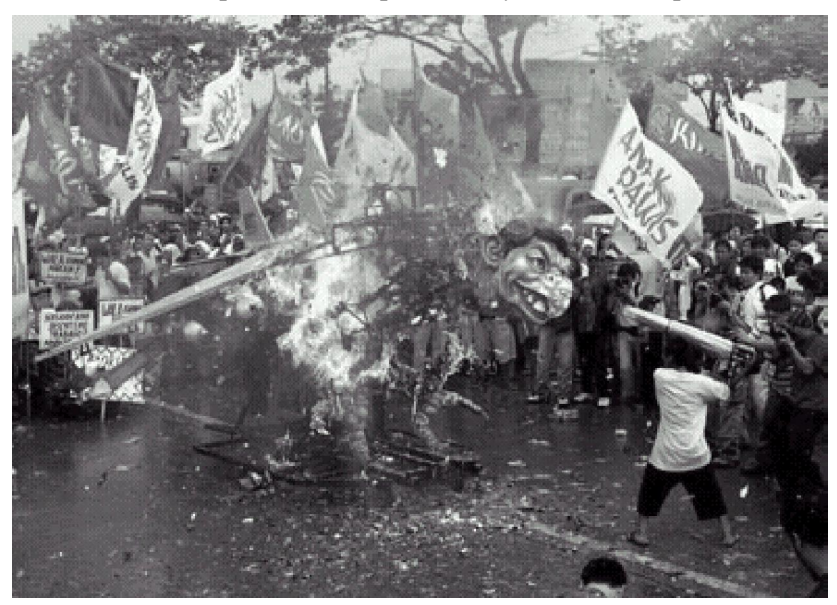
Figure 12. Activists burn "vulture" effigy of President Gloria Macapagal-Arroyo at rally on her State of the Nation Address, July 26, 2004. (Retrieved on January 16, 2005 from http://www.bulatlat.com/news/4-48/4-48-photos.html.)

Globalization frowns upon the existence of government-owned and controlled corporations and passionately exhorts their privatization.