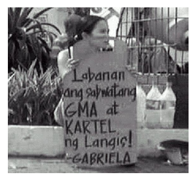
Figure 7. A woman holds an LPG tank-like placard to creatively send the message to oppose the conspiracy between President Gloria Macapagal-Arroyo and the oil cartel in a nationwide transport strike on November 24, 2004.