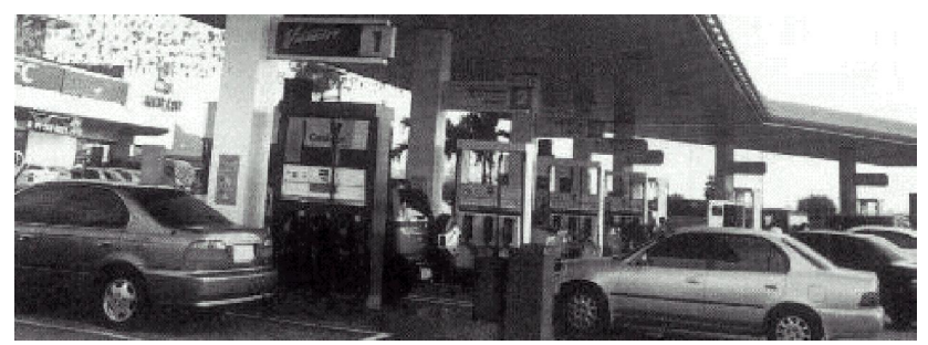
Figure 13. This picture shows not only cleanliness but also order in giving service to the customers of a gas station. As the faces of motorists are not shown, there are no discernible human emotions. Conflict is also absent, giving the impression that everything is in order. ( Philippine Graphic , July 19, 2004, p. 22)

The culture of acclimatization is not just confined to frequent changes in the prices of petroleum products but also includes the acceptability and irreversibility of the deregulation of the downstream oil industry.