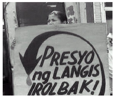
Figure 8. A protester calls for the rollback of oil prices using bright colors to effectively communicate her demand in a nationwide transport strike on November 24, 2004. (Retrieved on January 16, 2005 from http://www.geocities.com/arkibo13/10-strike/strike.htm.)

Figure 7. A woman holds an LPG tank-like placard to creatively send the message to oppose the conspiracy between President Gloria Macapagal-Arroyo and the oil cartel in a nationwide transport strike on November 24, 2004. (Retrieved on January 16, 2005 from http://www.geocities.com/arkibo13/10-strike/strike.htm.)