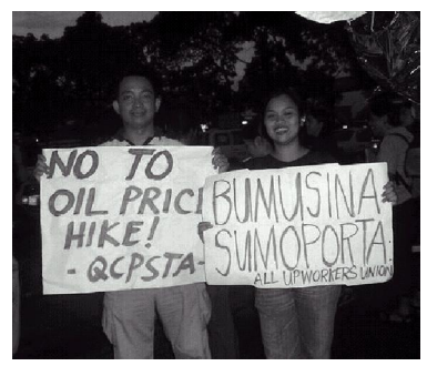
Figure 6. Members of the Quezon City Public School Teachers Association (QCPSTA) and All-UP Workers Union lend support for campaign against oil price hikes in a rally on August 9, 2004 at Philcoa, Quezon City.