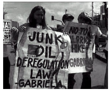
Figure 9. In a nationwide transport strike on November 24, 2004, protesters did not just oppose oil price hikes. They also called for the repeal of the oil deregulation law, the details of which are not widely reported by the mainstream media. (Retrieved on January 16, 2005 from http://www.geocities.com/arkibo13/10-strike/strike.htm.)

Figure 8. A protester calls for the rollback of oil prices using bright colors to effectively communicate her demand in a nationwide transport strike on November 24, 2004. (Retrieved on January 16, 2005 from http://www.geocities.com/arkibo13/10-strike/strike.htm.)