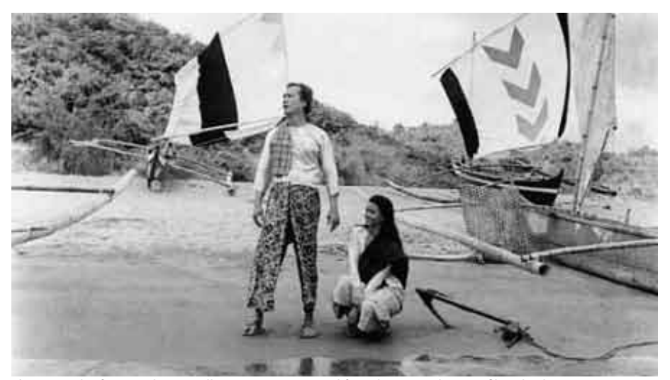
Figure 6. Clip from Badjao (Avellana, 1957).

British dictionary as early as the 16th century. In relation to Zamboanga, running amok applies to both "civilized" coastal people and "barbaric" sea gypsies. It is essentially reductionist, pigeonholing people into fixed decontextualized categories or stereotypes. What is insidious with stereotype is that it does not portray subjects with agencies that can enable them to go beyond or against the type constructed of them. And thus, after some twenty years, it is a relief to watch an alternative to this stereotype, in Lamberto Avellana's Badjao (1957), the non-Orientalist film also about the sea gypsies. This undermines the stereotyping between the land-dwelling Moslem Tausug and the sea gypsies or Badjao. In that film, which combines ethnographic realism with human drama, the heroine decides to transform herself, becoming a sea gypsy, thus discarding the stereotype she herself carried as a "brave and arrogant" Tausug vis-à-vis the lowly sea nomad Badjao.