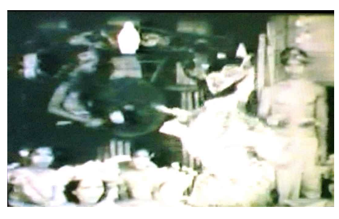
Figure 5. Third kulintang clip where the Javanese-style gong music is not synchronized with the kulintang strokes (De Castro, 1937).

The scene is unsettling for it desecrates the authenticity of Javanese music and it stands in stark contrast to the diegetic presentation of the Tausug kulintang. Thus, from the way the two traditional gong music scenes are