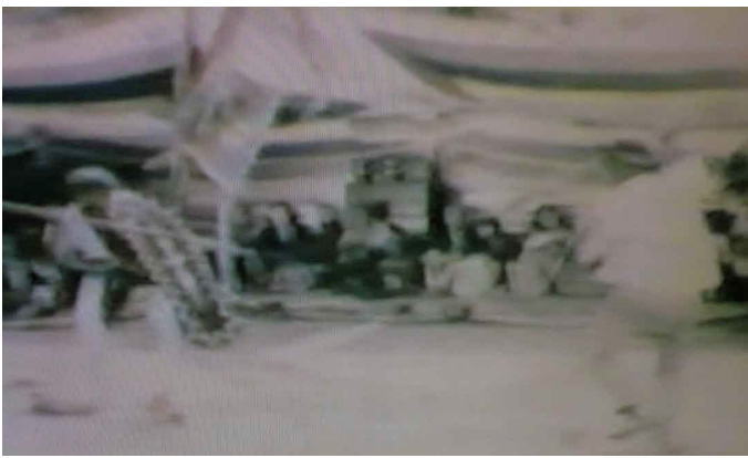
Figure 4. Second kulintang clip where kulintang music accompanies the spear dance (De Castro, 1937).