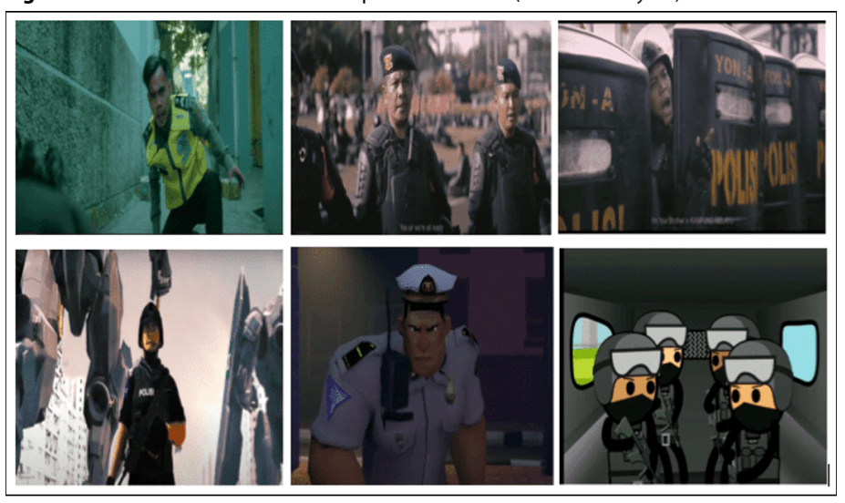
Fig. 1. Police is Masculine with Full Weapon and Armors (author's analyses)

Military masculinity is associated with physical strength, power, aggressiveness, independence, discipline, sexual potency, violence, heterosexuality, invulnerability, commitment to mission, and the ability to face situations (Kachtan, 2016). We found that these characters attach to the police figure that appears in the film winner of the 2019 PMF. The masculine character performs in some scenes as follows: