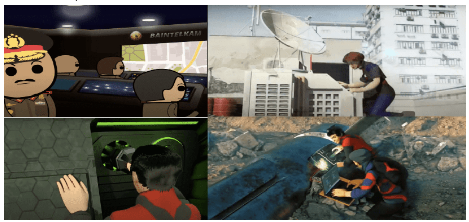
Fig. 3 . Technology as a Tool to Demonstrate the Strength of the Indonesian National Police. (Author's Analyses)

The winner of the 2019 PMF, especially in the animation category, embodies the term "strong" in the police through the scene on their films. It shows that the Indonesian National Police has the latest technology that is better than its opponent. The use of the newest high-tech equipment makes the police a hero who can be relied on to overcome all problems.